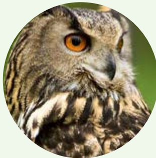
The Eagle- Owl