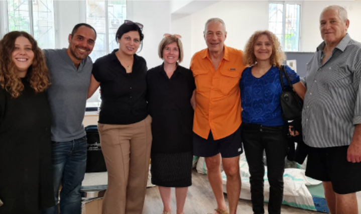
The Fidel Youth Centre