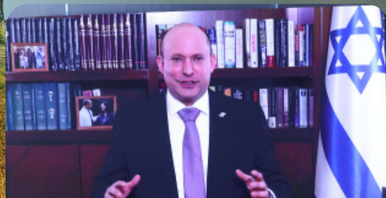
Former Prime Minister Naftali Bennett addressing the Israeli launch of CSP