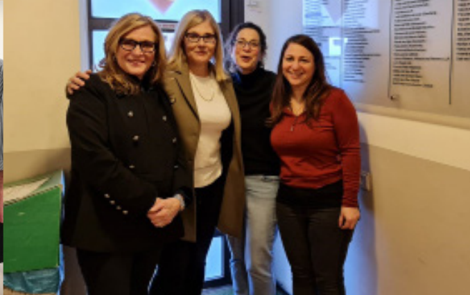
Shabtai Levi Home